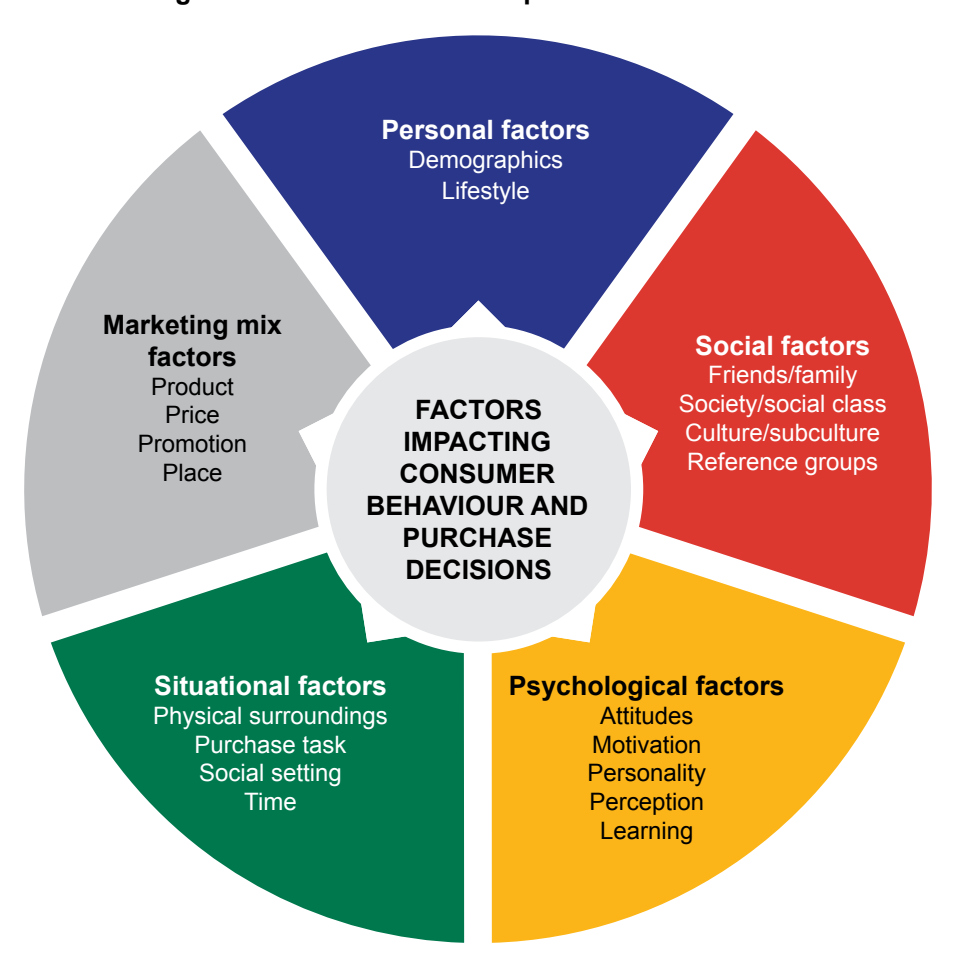
Figure 9.1: Factors affecting consumer behaviour and purchase decisions

Age and life stage are key demographic factors that influence decision-making. Preferences may be influenced by the stage of life a consumer is in (for example, child, young single, married with children, empty nester, or pensioner). For example, a 14-year-old will likely be financially dependent on a caregiver although they may have already developed strong preferences that could continue into adulthood. A single student would have very different consumption characteristics when compared to a new parent.