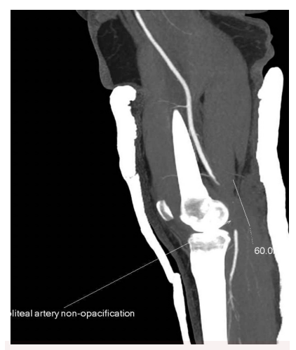
Picture of CT scan: Injected arterial contrast shows obliteration of the popliteal artery.

A CT angiogram is often performed to rule out popliteal artery injury (See CT scan). Renal function should be optimised before injection of the contrast.