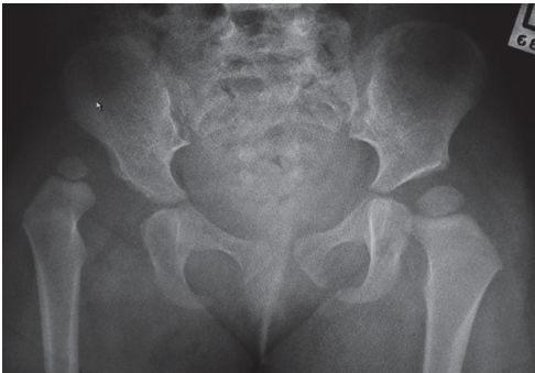
Right hip dislocation

Posterior dislocations account for 80% of hip traumas. Low energy injuries cause traumatic hip dislocations in the younger child (2–5 years) due to associated ligamentous laxity. In older children (11–15 years), dislocated hips are caused by higher energy injuries and have a higher association with acetabular fractures, although this is rare. Dislocations are more common than fractures in the paediatric population.