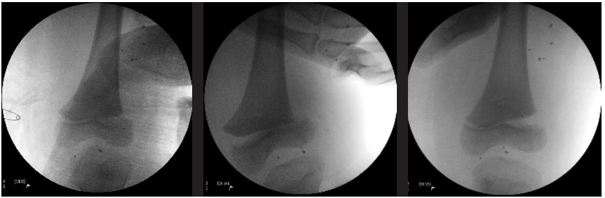
Distal femur fracture: (A) Salter Harris type I fracture of distal femur; (B) Stress view with valgus force; (C) Stress view with varus force