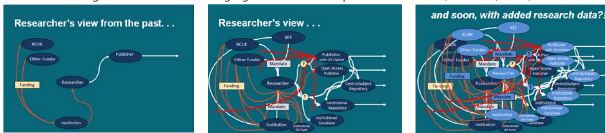
Figure 1: View of the changing research landscape for researchers (Hubbard, 2015)

work (REF) - has complicated the research landscape even further. Now HEIs are required to measure and report on the impact of their research activities as well as the quantity and quality of their research outputs. Impact accounted for 20 per cent of the overall REF score in 2014. In the guidance provided by HEFCE, SFC, HECW, and DEL, Research Excellence Framework (REF) review panels were asked to assess the: