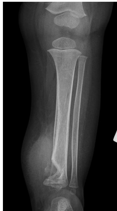
Figure 1: A lesion in the metaphysis of the distal tibia

There is a lesion affecting the medial distal metaphysis of the tibia. The lesion has sclerotic margins and is well demarcated. There is a significant soft tissue component as is evidenced by a soft tissue mass medially. There is some calcification in the lesion. There is a periosteal reaction on the medial diaphysis. These x-ray features are