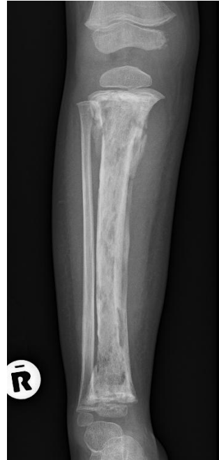
Figure 3: An x-ray of a young child with chronic osteomyelitis of the tibia. Note the irregular cortices, areas of lysis and sclerosis, as well as the developing sequestrum and involucrum. There is a pathological fracture in the proximal metaphyses. The epiphyses are spared and the fibula appears normal.

conditions, x-rays are typically normal, although you may be able to appreciate the soft tissue swelling.