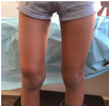
Figure 4a: 12-year-old boy presenting with thigh swelling and pain

MRI is the most specific investigation available. It can detect very early changes in cases of infection, and it can differentiate accurately between different pathologies that may cause a painful, swollen limb. Figure 4a shows a 12-year-old boy who presented with thigh swelling and pain. X-rays and blood investigations were normal. MRI demonstrated a large vascular malformation in the thigh.